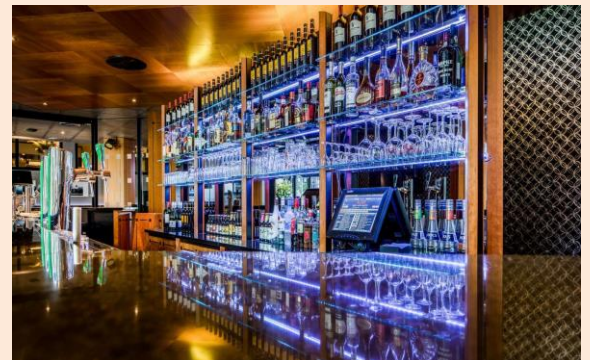
The Ruwenberg bar

Despite the increase of costs for the hotel, we managed to keep the participation fee the same as last year! The registration fee for the 3-day conference is € 339,-