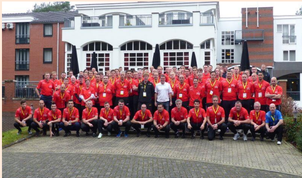
Former congress: 120 coaches from 20 different countries!

The auditorium of “de Ruwenberg” can accommodate up to 200 participants. At the end of the day, you can enjoy a drink in the cozy bar.