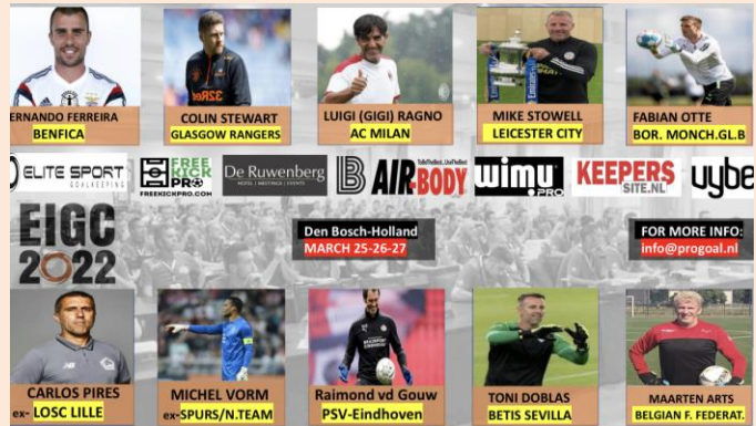
Top Coaches presented at the EIGC 2022